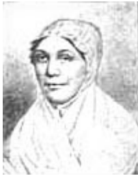
Bishop Richard Allen and wife, Sarah Allen