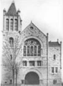
Mother Bethel African Methodist Episcopal Church, Philadelphia, PA